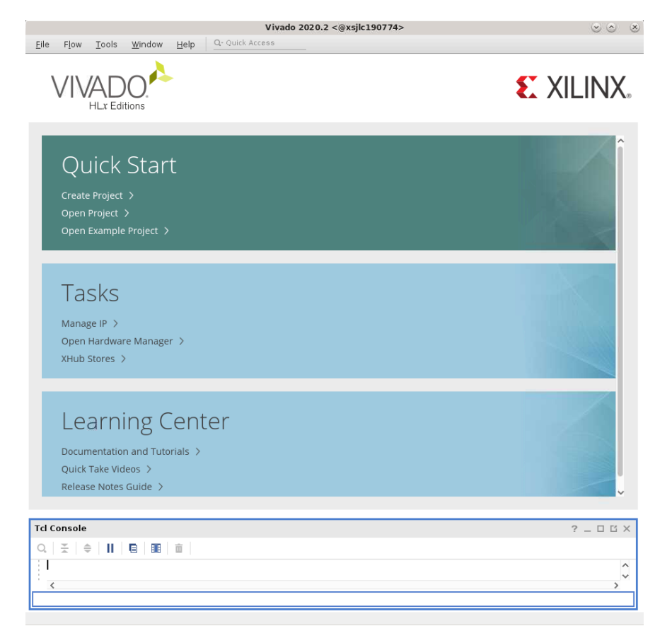
Figure 2: Vivado IDE Getting Started Page

When you launch the Vivado IDE, the Getting Started page, shown in the following figure, displays and provides you with different options to help you begin working with the Vivado Design Suite.