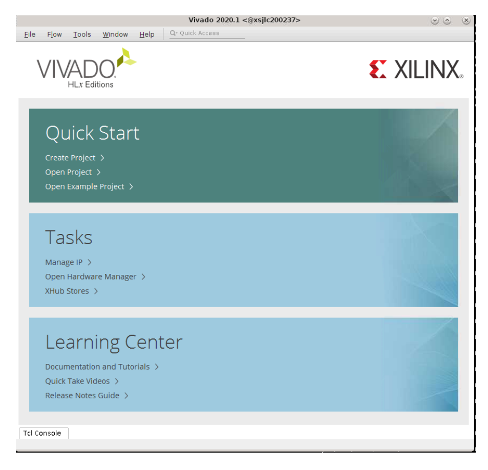
Figure 2: Vivado IDE Getting Started Page

When you launch the Vivado IDE, the Getting Started page, shown in the following figure, displays and provides you with different options to help you begin working with the Vivado Design Suite.