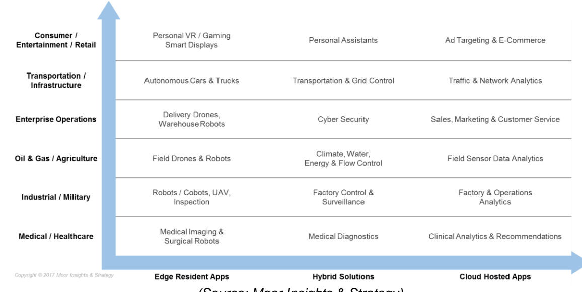
FIGURE 1: A MACHINE LEARNING APPLICATION LANDSCAPE

sub-segmented by edge, cloud, and hybrid deployment environments. As a later section explores, the ideal hardware to support these applications spans a wide range of alternative architectures. The applications in Figure 1 all run some sort of pre-trained neural network, such as a deep neural network, a convolutional neural network, a recurrent neural network, etc. At this point, it is premature to size these market segments, but each represents a significant opportunity, and each is attracting a large number of solution developers, primarily in venture-capital backed startup firms.