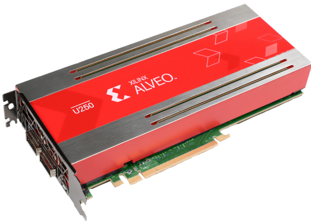
Figure 2. Alveo U250